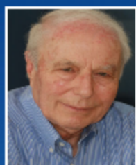
Avram Hershko 2004 - Chemistry