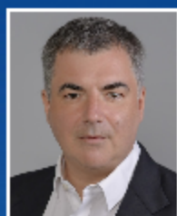
Konstantin Novoselov 2010 - Physics