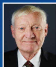
Joachim Frank 2017 - Chemistry