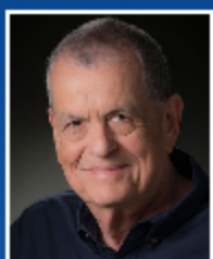
Aaron Ciechanover 2004 - Chemistry