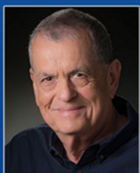
Dr. Aaron Ciechanover

Dedicated in Honor of Nobel Laureate in Chemistry, Prof. Aaron Ciechanover