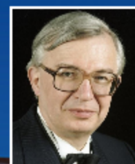
Jean-Marie Lehn 1987 - Chemistry