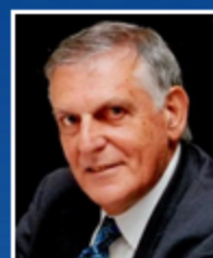
Dan Shechtman 2011 - Chemistry