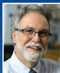
Gregg L. Semenza 2019 - Medicine