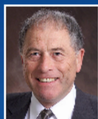
Kurt Wüthrich 2002 - Chemistry