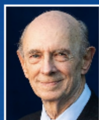
Harvey J. Alter 2020 - Medicine