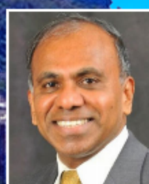
Subra Suresh President, Global Learning Council Switzerland Former Director NSF, USA