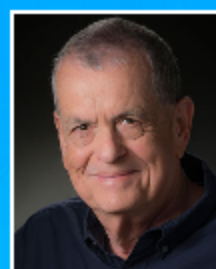
Aaron Ciechanover 2004 - Chemistry