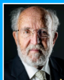
Michel Mayor 2019 - Physics