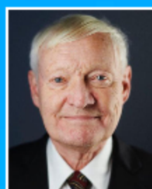
Joachim Frank 2017 - Chemistry