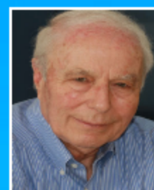
Avram Hershko 2004 - Chemistry