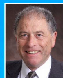
Kurt Wüthrich 2002 - Chemistry