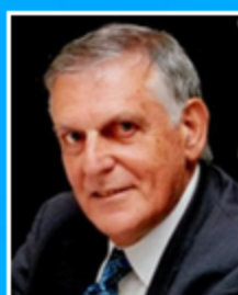
Dan Shechtman 2011 - Chemistry