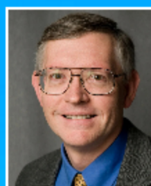
William E. Moerner 2014 - Chemistry